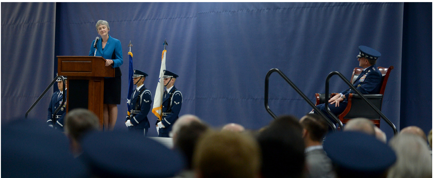
Secretary of the Air Force Heather Wilson speaks at her farewell ceremony at Joint Base Andrews, Md., May 21, 2019.

And while hardware is important, Goldfein said Wilson, “understood the priority is with the people and improving the quality of service and quality of life for our uniformed volunteers and their families is where it starts.”