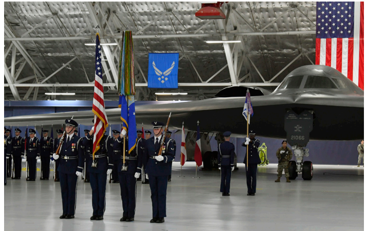
Air Force color guard presents the colors during Secretary of the Air Force Heather Wilson's Farewell Ceremony at Joint Base Andrews, Md., May 21, 2019.

“Every one of you in this hanger, every single one